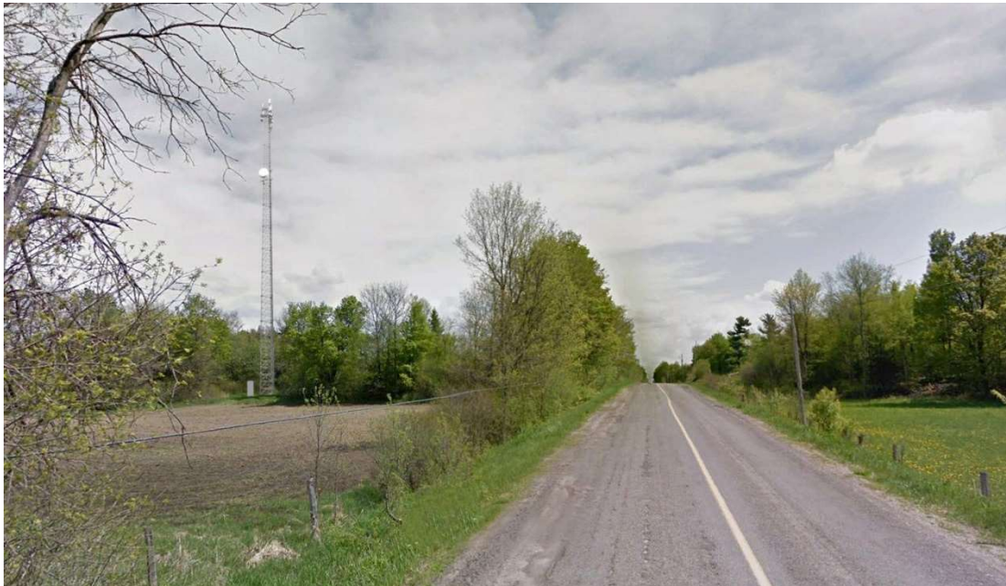
Above: Photosim of the proposed tower before and after– looking southeast from Concession 7A