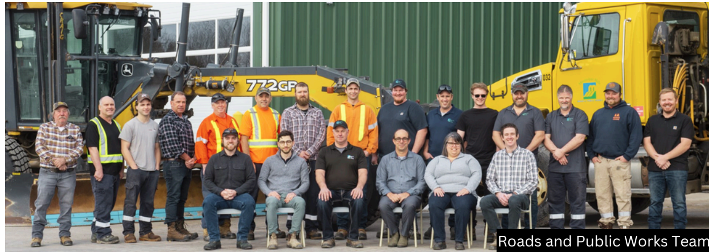
Roads and Public Works Team