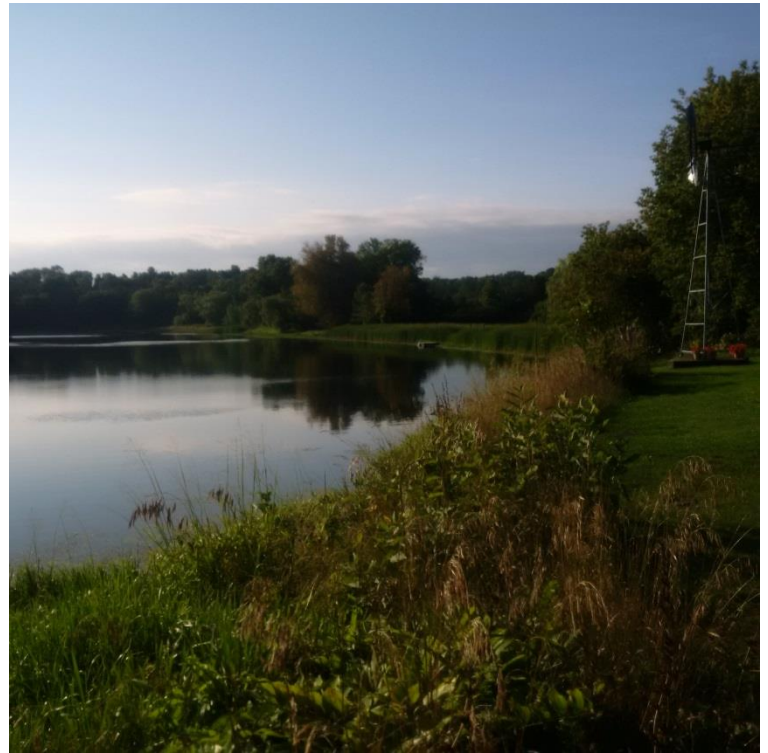
View from the 5 Arch Stone Bridge toward the Upper Falls