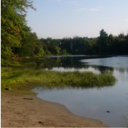
From the Pakenham Beach toward the Riverwalk Lookout