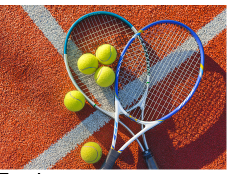
Tennis Ages: All ages

Registration: <u>5SpanStrong@gmail.com</u>