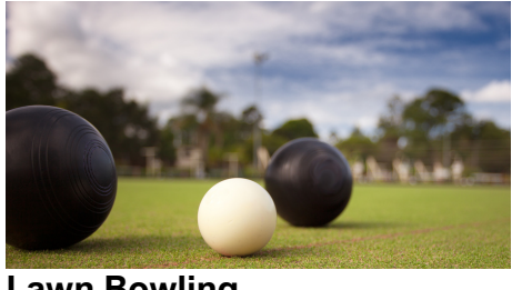
Lawn Bowling Aaes: 18+

Registration and information: www.clubspark.ca/AlmonteTen <u>nisClub</u>